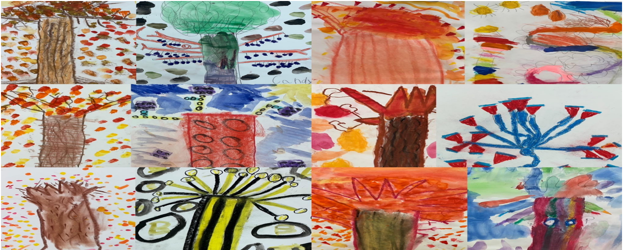
Grade 1-Surreal Trees